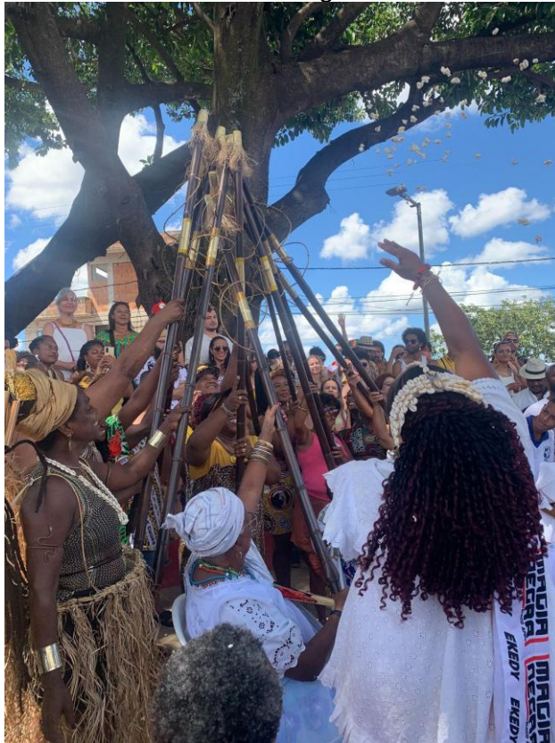
Figure 3: Presentation of the Afro Magia Negra Bloco during Carnaval in the Concordia neighborhood.

emergence of political activism. On the other, in Belo Horizonte, we identify how diasporic knowledge materializes in African-rooted cultural expressions. In this sense, we recognize a complementarity between the U.S. and Brazilian processes. Bringing these histories together strengthens our connection as siblings in the diaspora and opens possibilities for exchange, solidarity, and resistance against hegemonic forces—despite the social, political, and economic differences in which we are embedded.