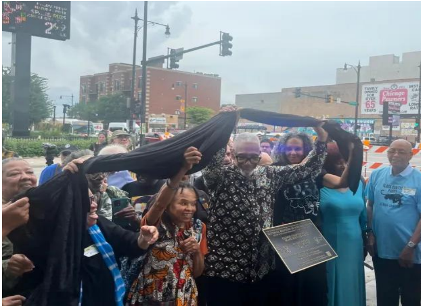
Figure 24: Ex-leaders of the Black Panthers inaugurate a plaque at the headquarters, now demolished, of the Illinois Chapter of the Black Panthers.